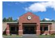
Cawley Middle School Old