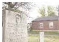
Head School #1